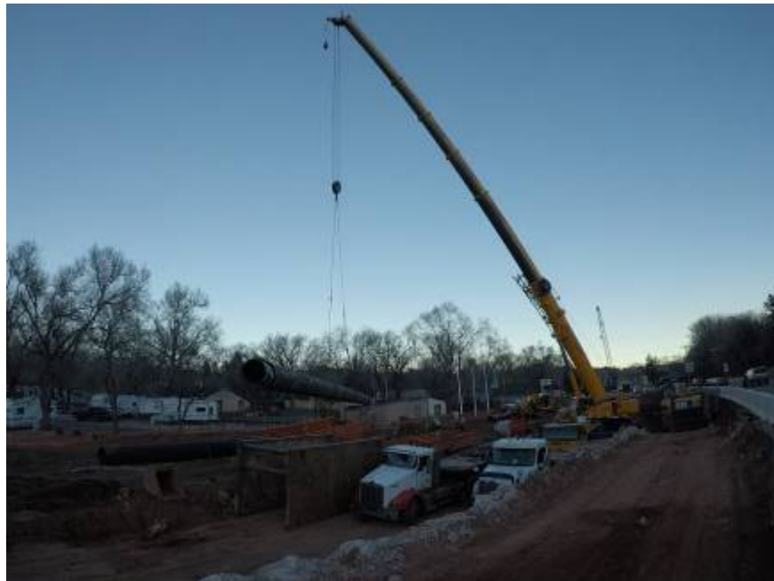
Lifting Casing for 30" pipe