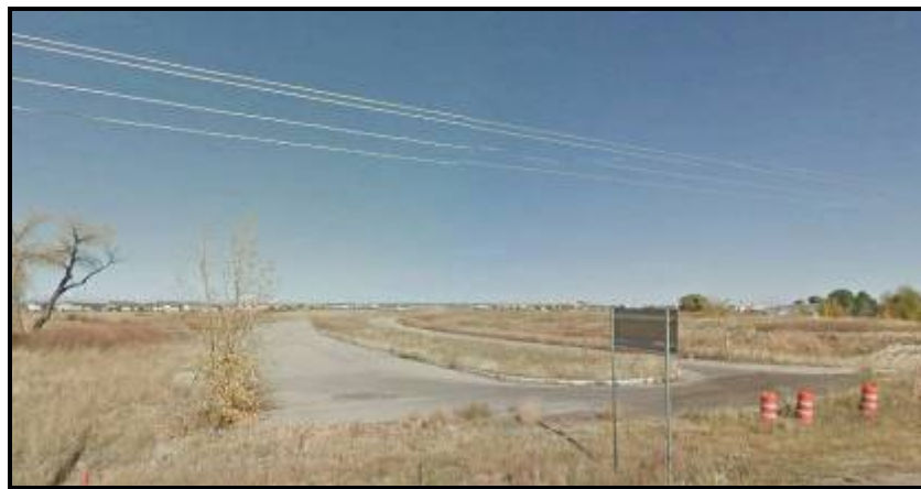
Existing Meridian Road approaching US-24