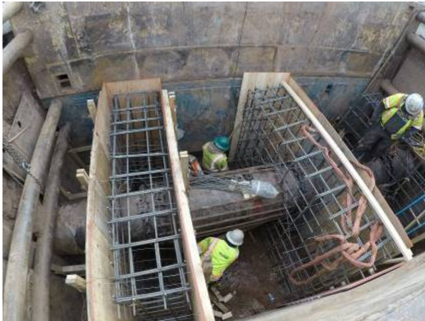
Constructing Concrete anchors for 30” water line