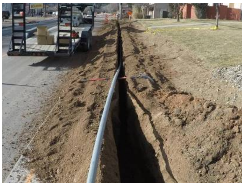
Installation of conduit for streetlights