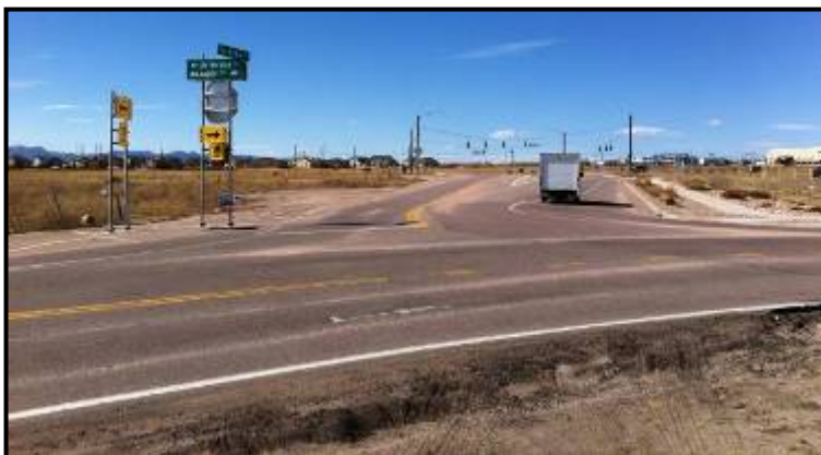
Northwest view at McLaughlin/Old Meridian